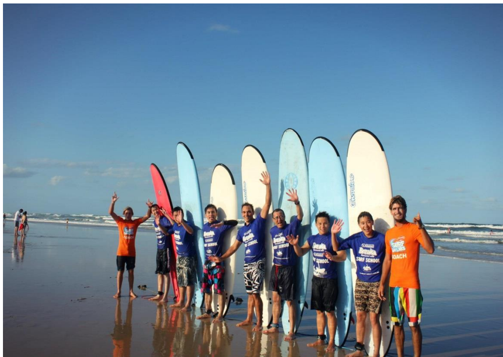
NATIONAL ALLIANCE YOUTH CAMP 2013, SUNSHINE COAST, QLD